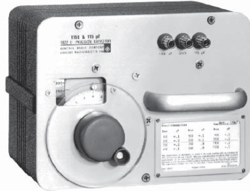
Model 1422 Precision Capacitor

A worm drive is used to obtain high precision of setting. To avoid eccentricity, the shaft and the worm are accurately machined as one piece. The worm and worm wheel are also lapped into each other to improve smoothness. The dial end of the worm shaft runs in a self-aligning ball bearing, while the other end is supported by an adjustable spring mounting, which gives positive longitudinal anchoring to the worm shaft through the use of a pair sealed, self-lubricating, preloaded ball bearings. Similar pairs of preloaded ball bearings provide positive and invariant axial location for the main or rotor shaft. Electrical connection to the rotor is made by means of a silver-alloy brush bearing on a silver-overlay drum to assure a low-noise electrical contact.